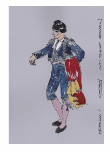
Caption: Costume sketch of Escamillo, courtesy of Opera Hong Kong and Thibaut Welchlin