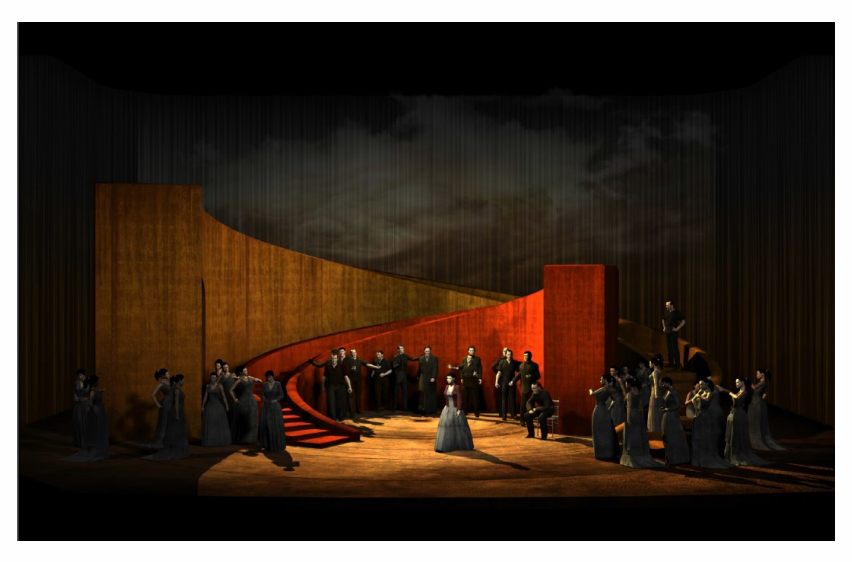
Caption: Rendering of rotating set for Carmen , designed by Bruno de Lavenère

Bizet's tale of desire and revenge presented by OHK and Le French May