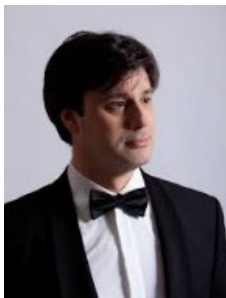
Ramfis, High Priest / King of Egypt Abramo Rosalen