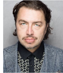
Amonasro, King of Ethiopia Burak Bilgili